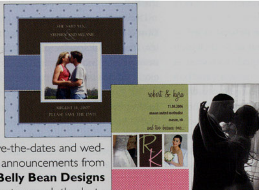
Save-the-dates and wedding announcements from Belly Bean Designs get extra punch thanks to personal photos. 617-306-8395