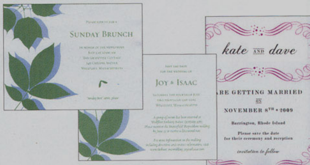
Coordinates from The Happy Envelope can stand alone, or their design elements can be replicated on several pieces. 865-457-7577

After the heartfelt vows are exchanged, the last dance is danced and the happy couple is back from a sunny honeymoon, the bloom is officially off the bridal rose. All that remains (other than a marriage) are memories, proofs that will hopefully soon come back from the photographer — and the paper ephemera commemorating different aspects of the occasion (this includes all the thank-you notes that still need to be written, of course).