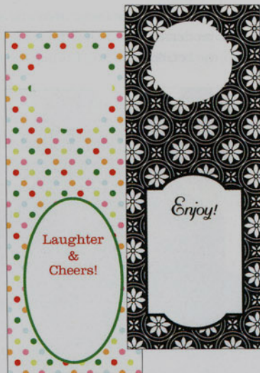
Brides are using these wine tags from Boatman Geller on wine bottles at reception tables, on water bottles in the hotel rooms of out-of-town guests and even as door knob hangers. 866-573-9429

Although some elements never really change, the contemporary wedding is always in flux. Take save-the-date cards for example. A decade ago these were restricted to a well-heeled urban crowd throwing weddings in exotic locales. These days, after receiving several in the mail for her friends' weddings, every bride has got to have one.